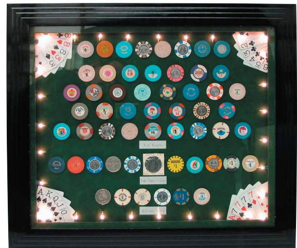
Las Vegas vacation memories are featured in this shadowbox that includes lights to give the illusion of being in a casino.