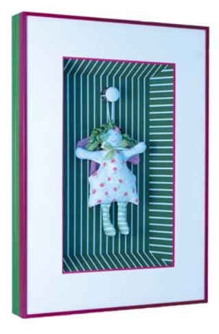
A Tooth Fairy doll is custom framed in a colorful, whimsical shadowbox design.